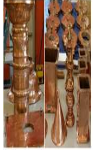
(In assembly stage)